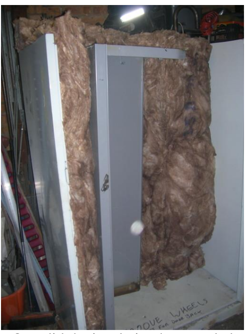
The 2 lockers cut down to their internal Overdid the insulation here, ended up using half this thickness all round