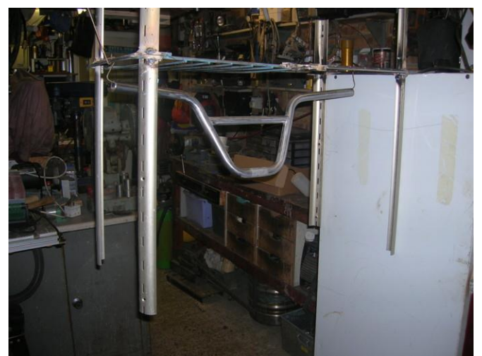
The handlebars hanging from the dual rack, this way up for hanging, the other way for placing items on,

The first job in the new oven, my son's been waiting for it to be finished to do some bike parts.