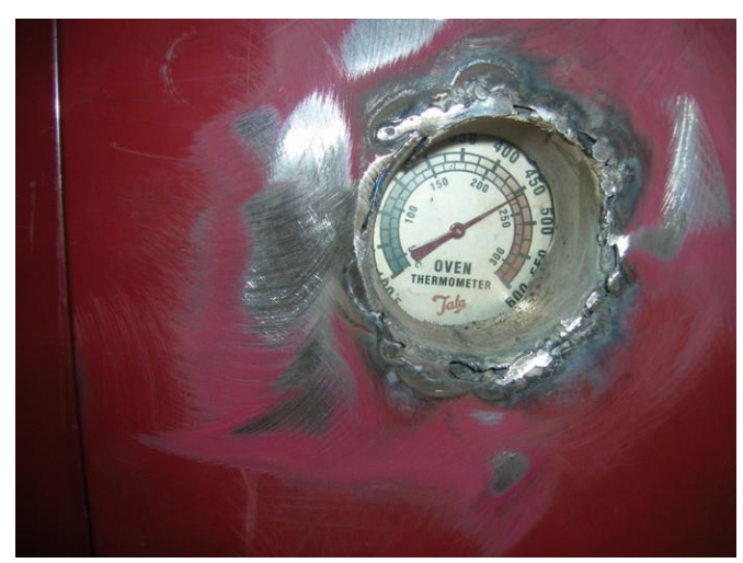
An oven thermometer shows the temp. I know the welding's crap, my mig's playing up.

The 2 oven elements are thermostatically controlled while the grill element is on a rheostat, I might fit a thermostat control to it in the future. It needs all three elements with the full sized oven being used. When the shelf is in place just the oven elements are needed, although it heats up quicker using all three then turning the third one off when it's at temp. The internal dimensions are; 36" wide, 54" high (26" with the shelf in place) and 17" deep I have fitted some fibreglass rope for door seals now (included in the £20 cost) which seem to be working well, and added a top latch to the doors.