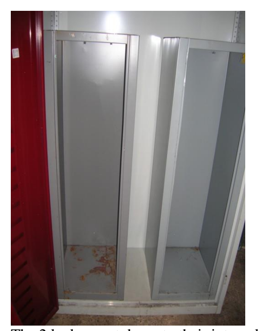
shelf height, trying for size.