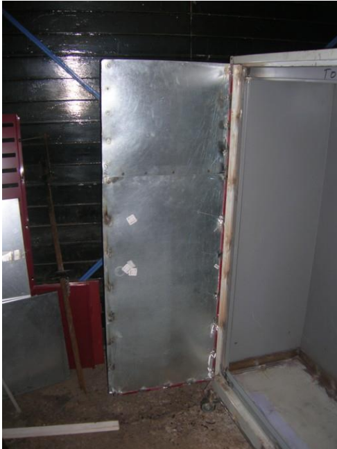
The doors insulated and skinned