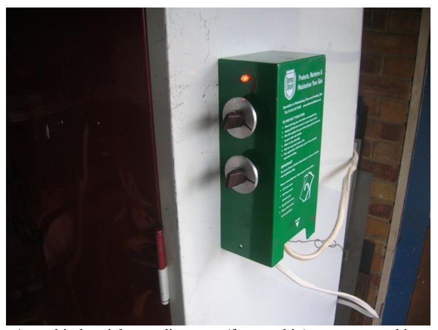
A steel industrial soap dispenser (from a skip) as my control box