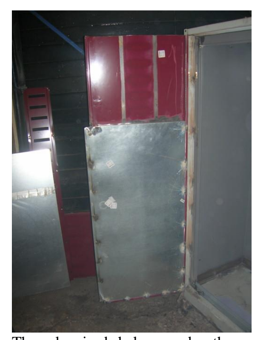
The galvanised shelves used as the Inner door skin, insulation packed in between