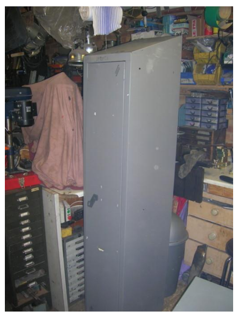
2 of these smaller lockers