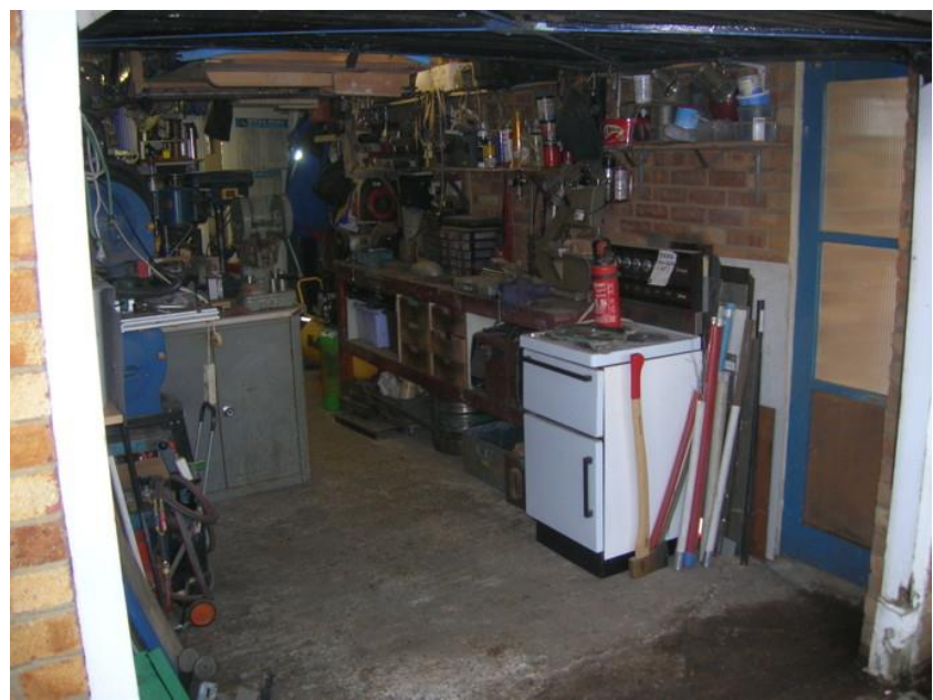
The donor cooker

I stripped the 2 oven elements, the grill element and controls from an old cooker. Collected two small industrial lockers and one bigger locker from skips, the big locker had 6 galvanised shelves which were used for the door inner skins and the insulated shelf. I also found a sack barrow in a skip which I used for the chassis, I changed the wheels for swivel wheels so now I can move it around the garage when it's in the way.