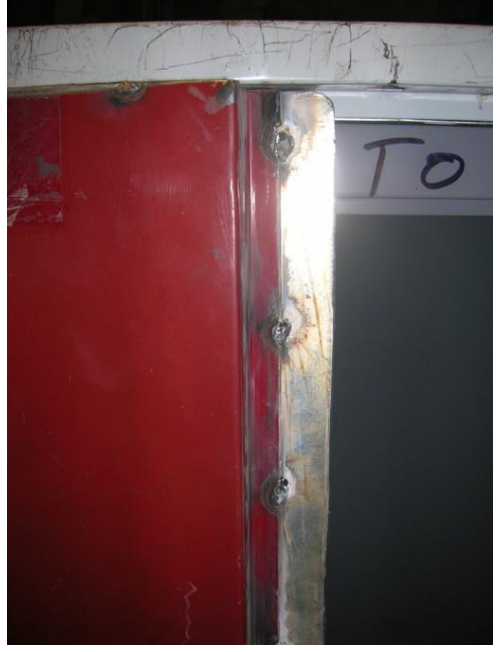
I left the skin wide on one door so the doors had a bigger overlap in the middle