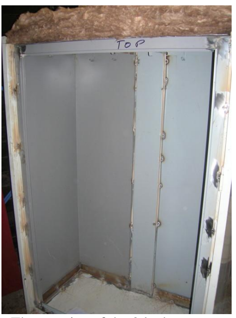
The remains of the 2 lockers welded in place with the infill