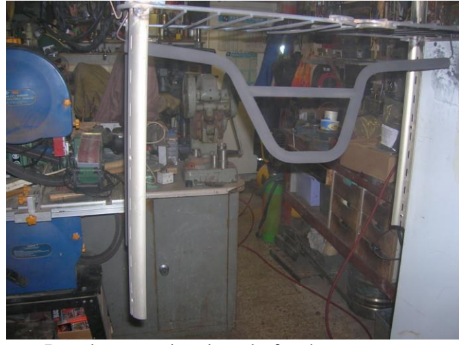
Powder coated and ready for the oven