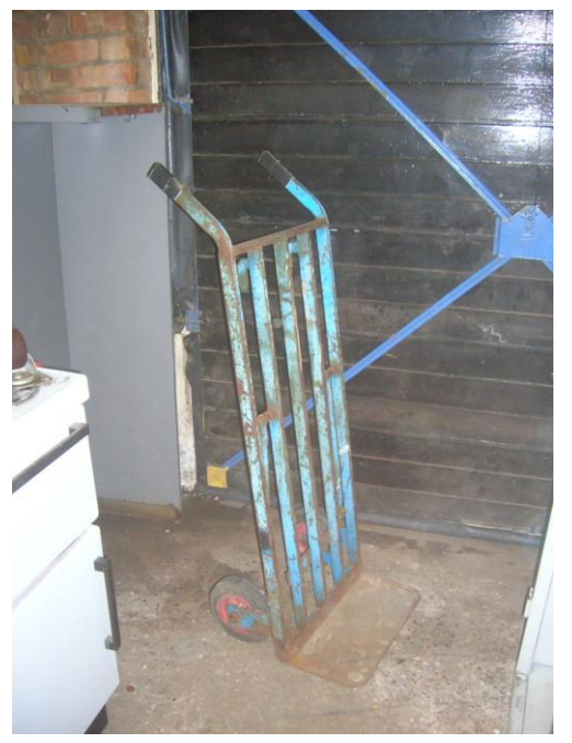
The sack barrow