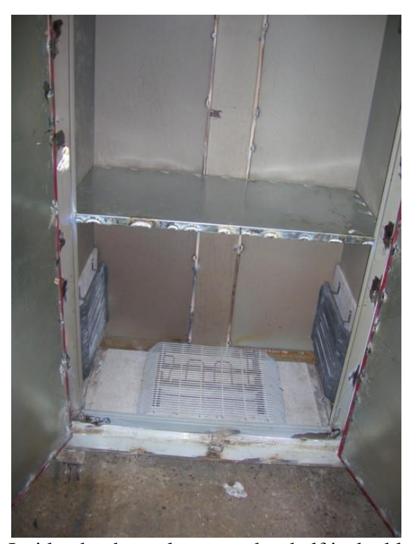
Inside, the three elements, the shelf is double skinned and insulated. When in place it cuts the oven area in half for better efficiency when all the height isn't needed, not perfect but it helps.