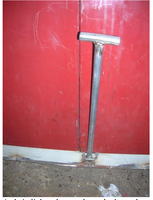
A chain link and tapered metal tube as the door closer, I know...... but it works!