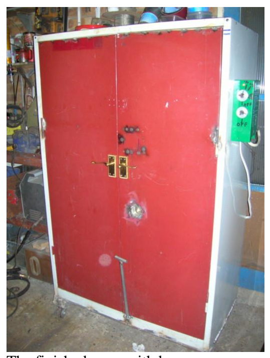
The finished oven with brass door handles. Below these in the right door is the thermometer.